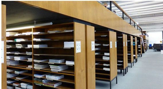
A newspaper archive

You will learn how archives work, to find sources and to analyse them, how to recognise and interpret propaganda such as current election posters or and how filter bubbles work in times of “alternative facts”.