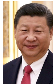
Xi Jin Ping