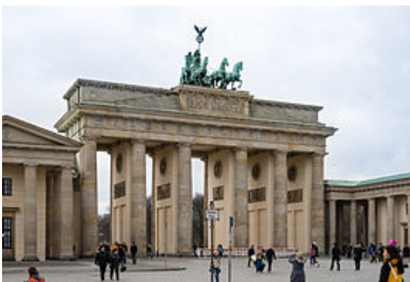
Brandenburg Gate in Berlin

The curriculum demands the visit of historical places on excursions. To study East Germany (DDR) we will go to Berlin, for the United Nations (Conflicts and Intervention) we will go to Geneva, each for several days. The archive work will take place at the University of Basel.