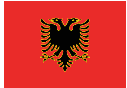
The flag of Kosovo