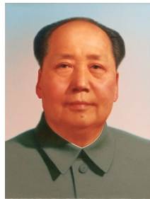
Mao Ze Dong