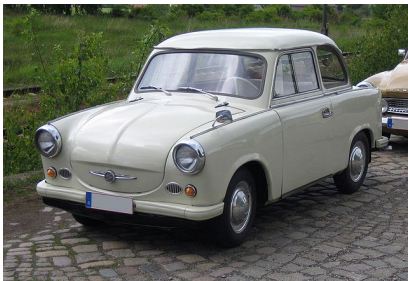
The famous "Trabi"

The topics lie outside of the standard curriculum, such as East Germany (=DDR), China from Mao to Xi, the US civil rights movement and today's struggle for equality, or how Kosovo gained independence. The idea is that you learn about history topics not covered in the standard history lessons.