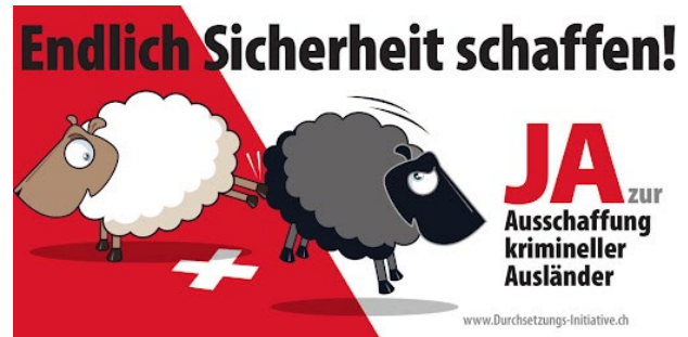
SVP poster 2018