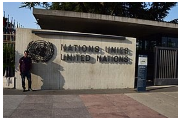
UN headquarters in Geneva